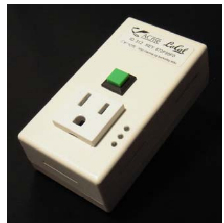
An ACme wireless power meter, developed and implemented as part of the LoCal project.

Power Savings Calculator: www.itpowersaving.com/power-saving-calculator